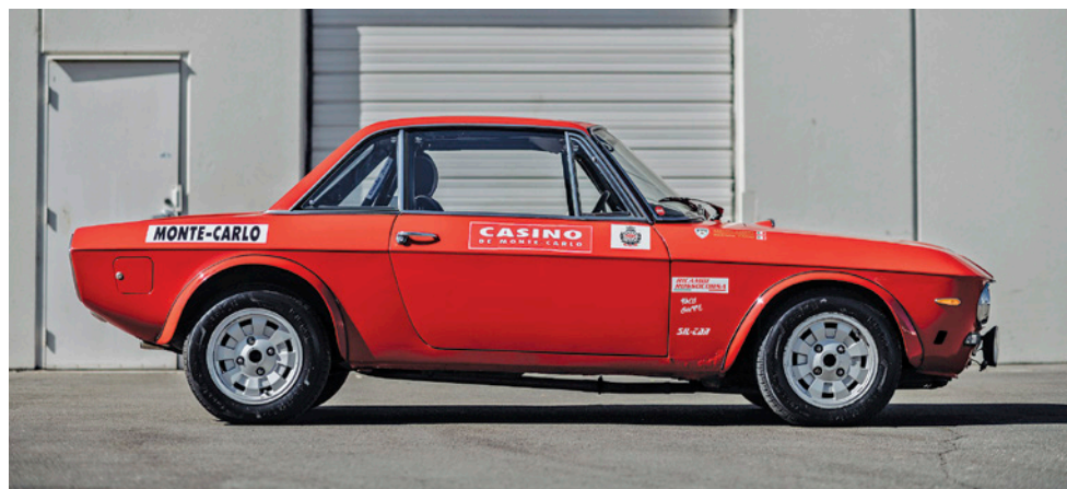
Part of the Homologation Collection: 1972 Lancia Fulvia coupe 1.6 HF

Modified by AMG Japan with a 385-hp, 6.0-liter V8, Bilstein dampers and special bodywork ■