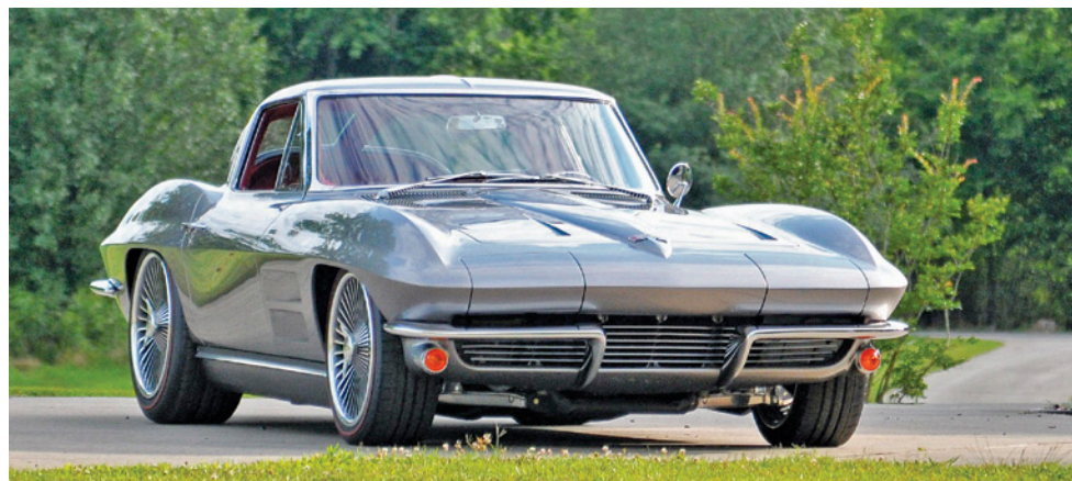
1963 Chevrolet Corvette custom Split-Window coupe

One of the most decorated and complete 1967 Corvettes in existence, with original documentation and highly optioned ■