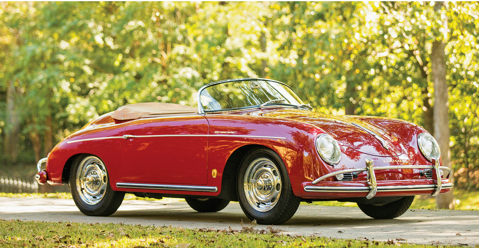
1958 Porsche 356A Speedster