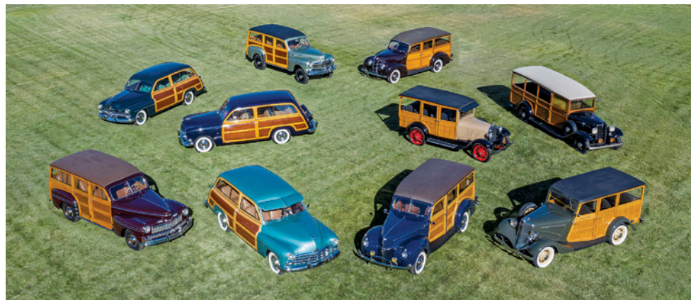
The Steelewood Collection of wood-bodied Ford and Mercury cars

Meticulously restored with complete documentation and receipts; one of only 146 produced ■