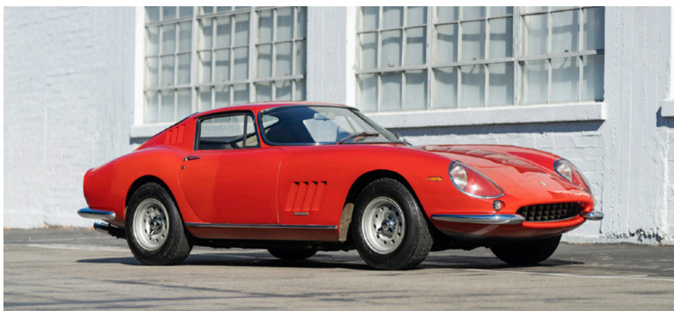
1966 Ferrari 275 GTB

One of just two convertible variants styled by Giovanni Michelotti at Bertone. Full restoration complete with a copy of the factory build sheet, restoration records and toolkit.