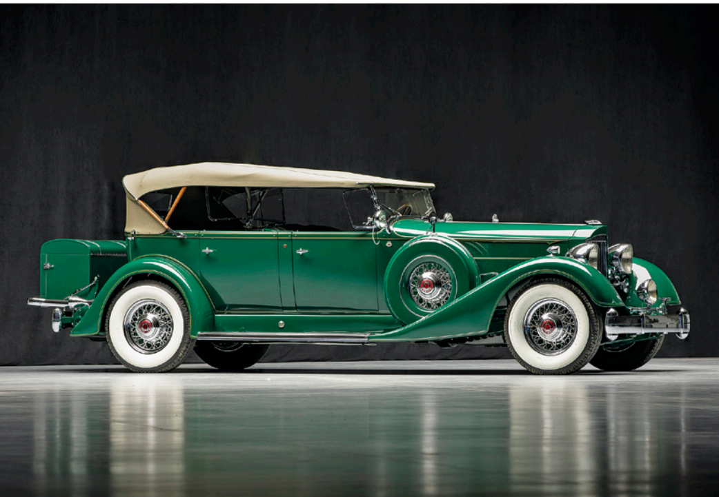
1934 Packard Twelve 1107 phaeton