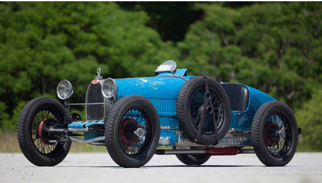
1926 Bugatti Type 37 Grand Prix