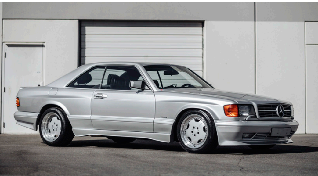
1989 Mercedes-Benz 560 SEC AMG 6.0 "Wide Body"