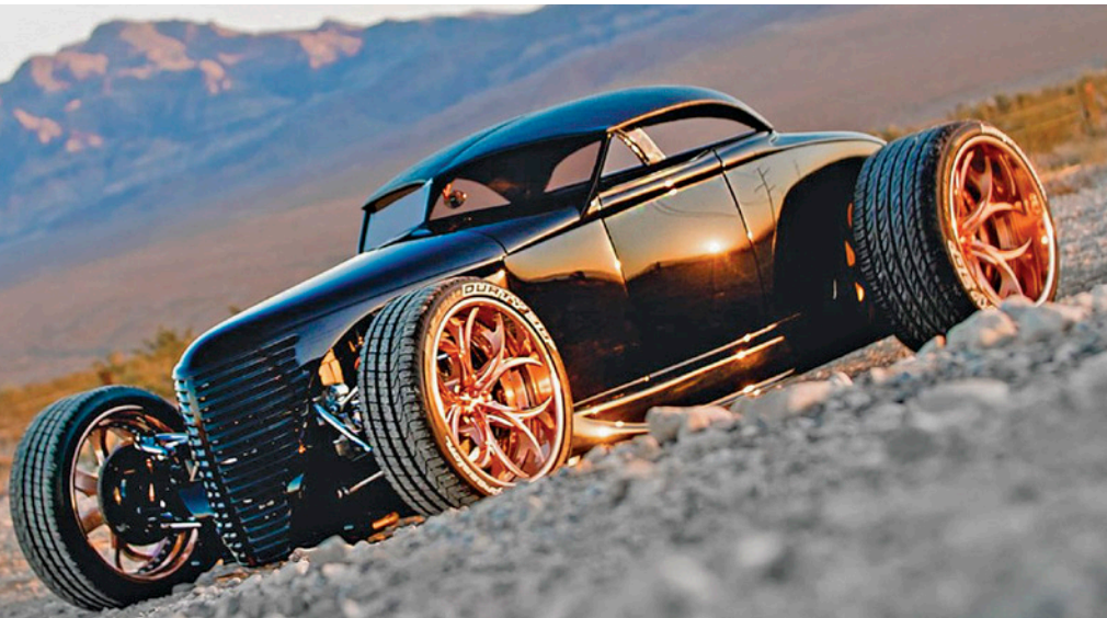
1930 Ford Model A custom roadster "Durdy 30"